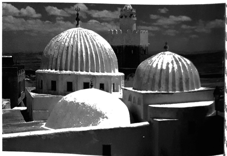
This is a mosque. Mosques are an important part of Muslim culture.

This means "good morning" in Arabic. In Arabic, you read the words from right to left. In English, you read the words from left to right.