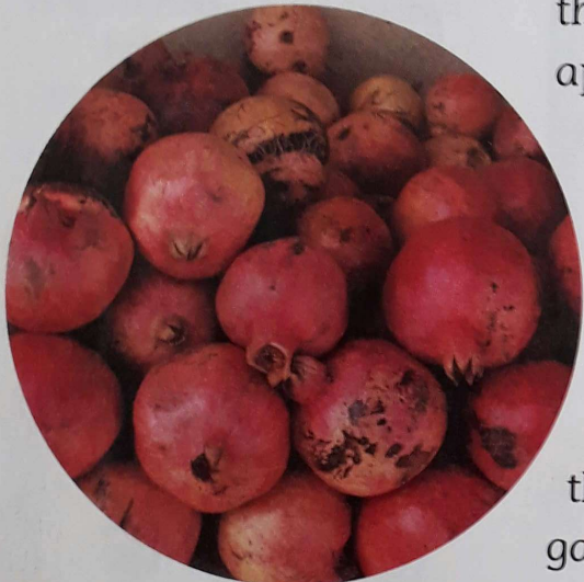
Pomegranates like these are a popular fruit during festivals.

During the Muslim month of Ramadan, my parents fast during the day. That means they don't eat or drink anything from sunrise until sunset. I don't fast because I am too young. After sunset, we eat a big meal.