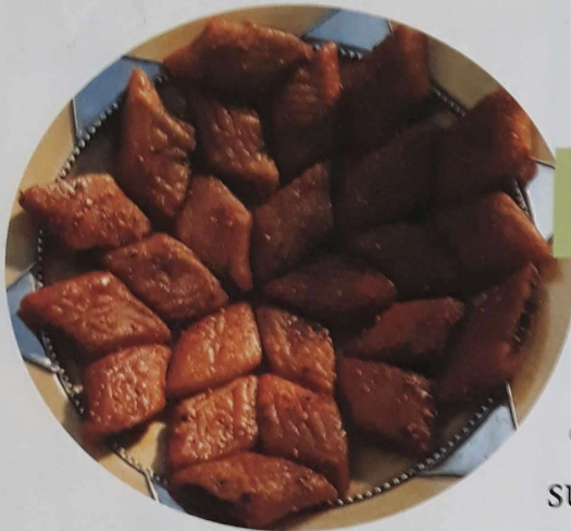
This sweet is eaten during Eid ul-Fitr . It's a pastry stuffed with dates.

During the Muslim month of Ramadan, my parents fast during the day. That means they don't eat or drink anything from sunrise until sunset. I don't fast because I am too young. After sunset, we eat a big meal.