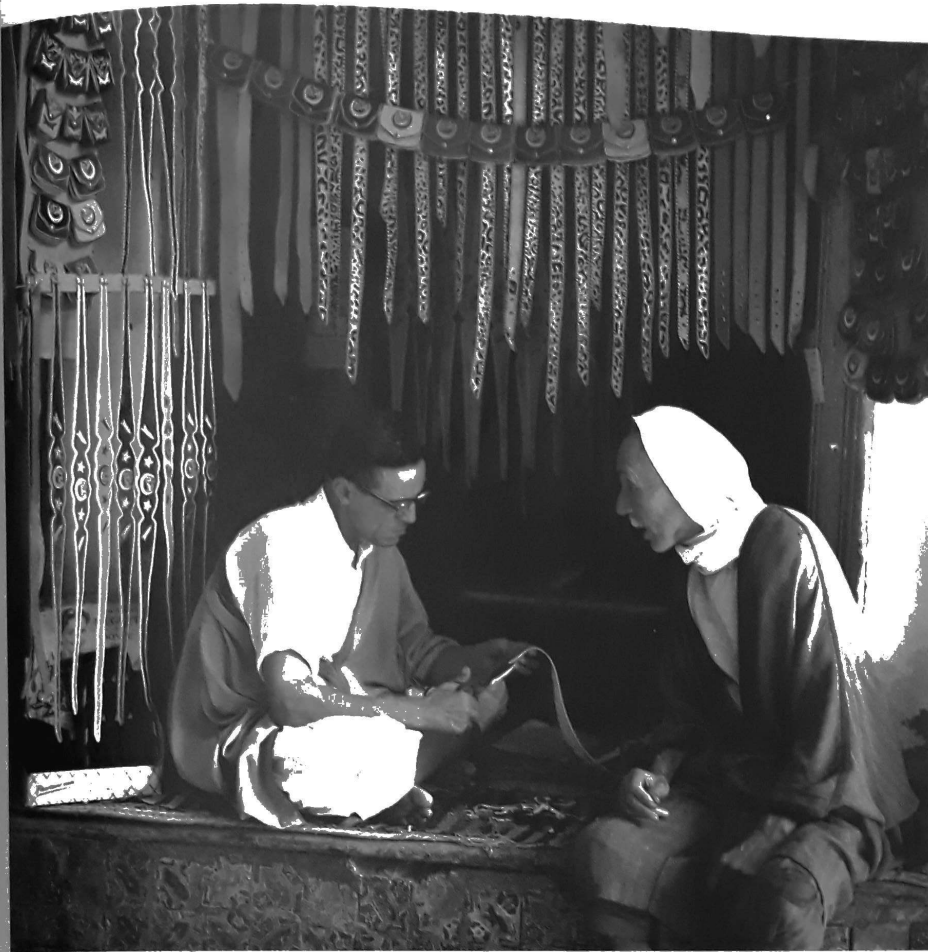
These men are wearing traditional clothes.