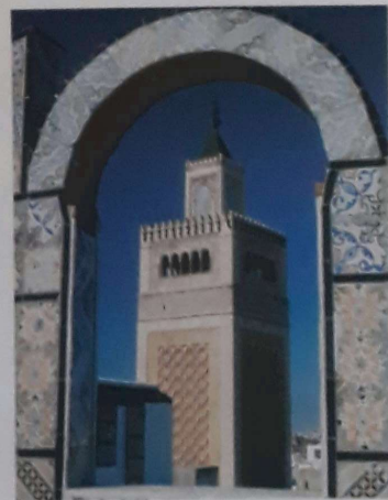
Zitouna Mosque in Tunis

Many tourists come to Tunisia because it has sandy beaches and a warm climate. People also want to see famous places such as this mosque in Tunis.